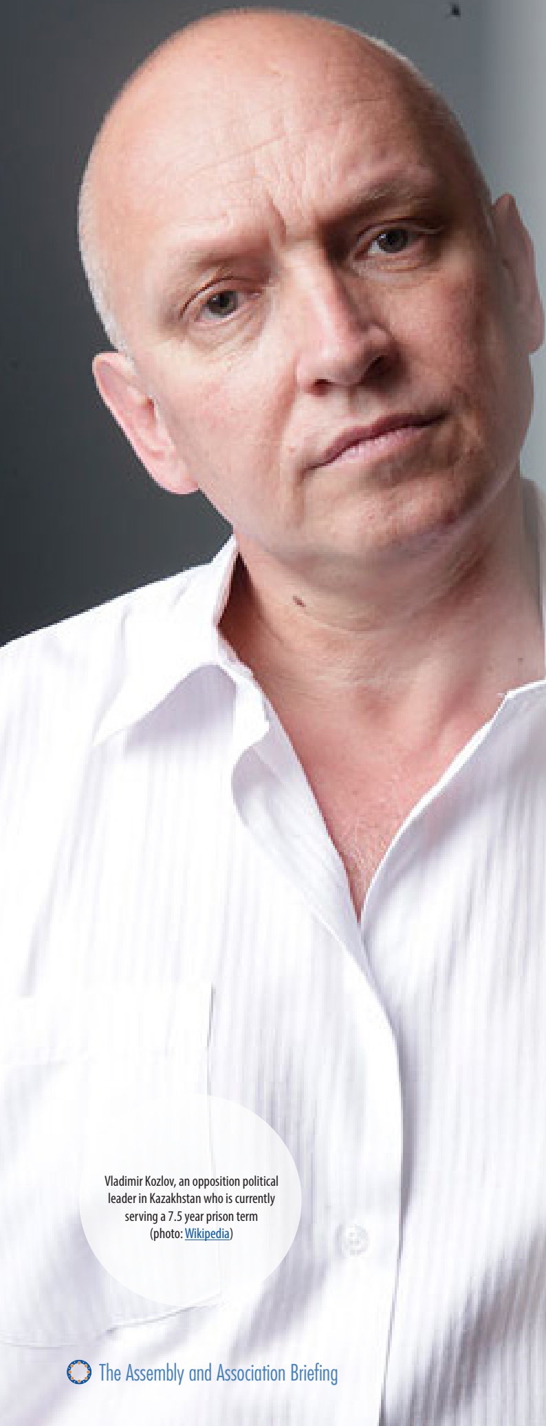
Vladimir Kozlov, an opposition political leader in Kazakhstan who is currently serving a 7.5 year prison term

Number of days in advance that Kazakhstan's public assembly laws require protesters to seek government permission for public gatherings